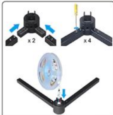
Step 1: Assembly 2 metal feet then connect the stripe into the lamp base.