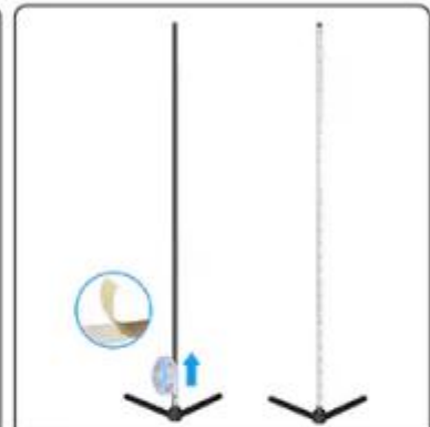
Step 3: Tear off the 3M tape from stripe, paste the stripe on assembled well aluminum tubes.