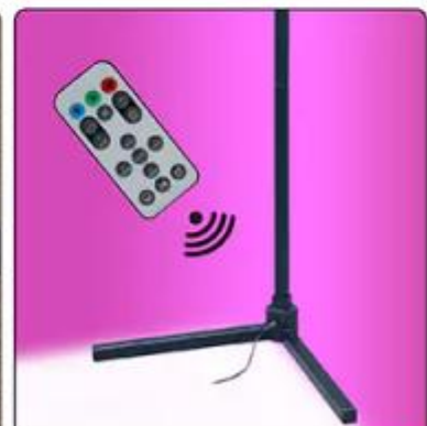
Step 6: Use Remote control or Tuya APP set up your conner light.

The Acrylic lampshade with temperature resistance. Perfect light transmittance for real light color, The metallic paint makes lamp body smooth and shiny. The product edges all pass fine grinding, the surface is glossy and smooth. There are 3 sponge mats at the bottom of the lamp which can effectively avoid scratches.