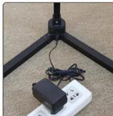
Step 5: Connet the power supply.